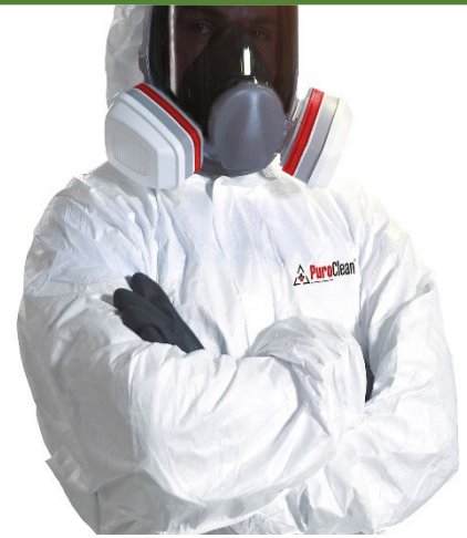
Unsung hero of the Covid 19 Pandemic

PuroClean is a preferred vendor for several national and regional insurance carriers such as Liberty Mutual, Allstate, Travelers, and Heritage Insurance.